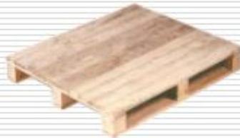
Four way Entry - Close boarded