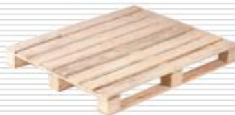
Four way Entry - Wing Type