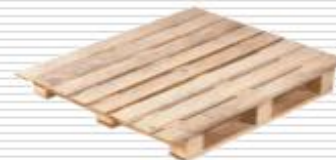
Four way Entry - Open boarded