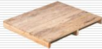
Two way Entry - Close boarded