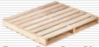
Two way Entry - Reversible