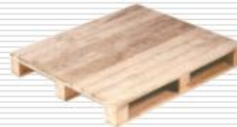
Four way Entry - Perimeter base