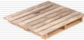
Two way Entry - Wing Type