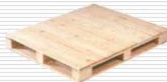
Four way Entry Close boarded