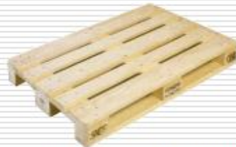
Euro Pallet - 1200 X 800